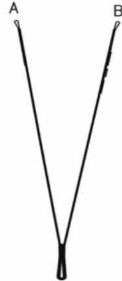
SKATE2 SCHOOL RISERS