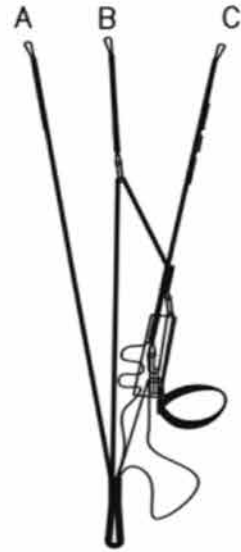
NEUTRAL POSITION: · IDEAL POSITION TO TAKE OFF