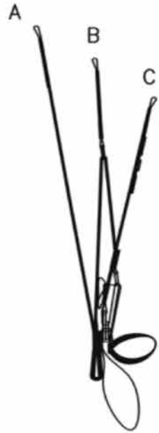
SLOW POSITION: · MINIMUM SPEED · MAXIMUM GLIDE