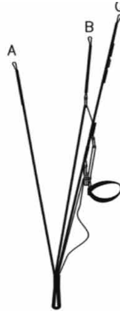
FAST POSITION: · MAXIMUM SPEED